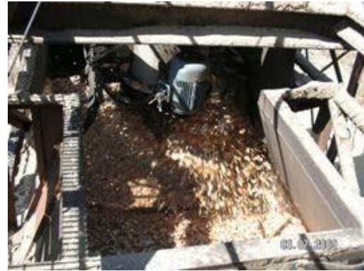
Densifier™ Loading Railcar