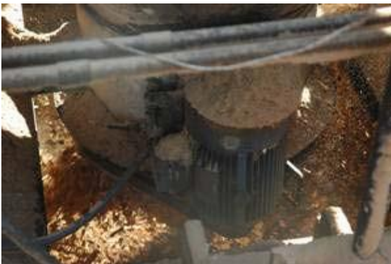
Densifier™ Loading Railcar